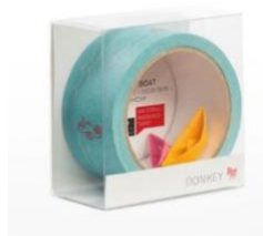
My First Boat Tape £12