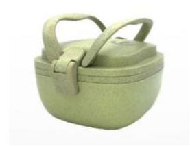
Rice Husk Lunchbox £16