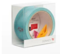
My First Boat Tape £12