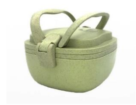
Rice Husk Lunchbox £16