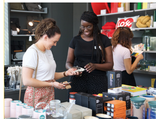
^ Target audiences for the Design Museum shop includes adult design enthusiasts